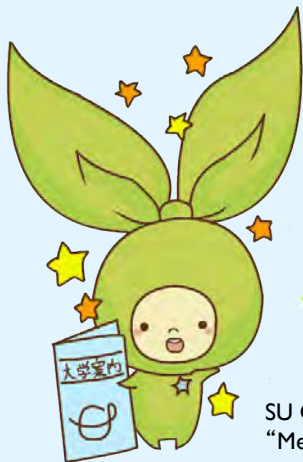
SU Official Mascot "Merin-chan"

We are looking forward to seeing you in Saitama!